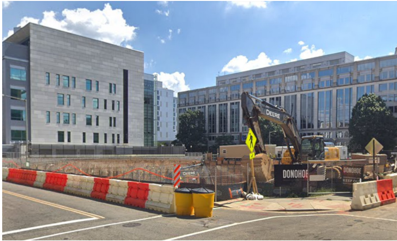
2. 6th Street SW and School Street SW