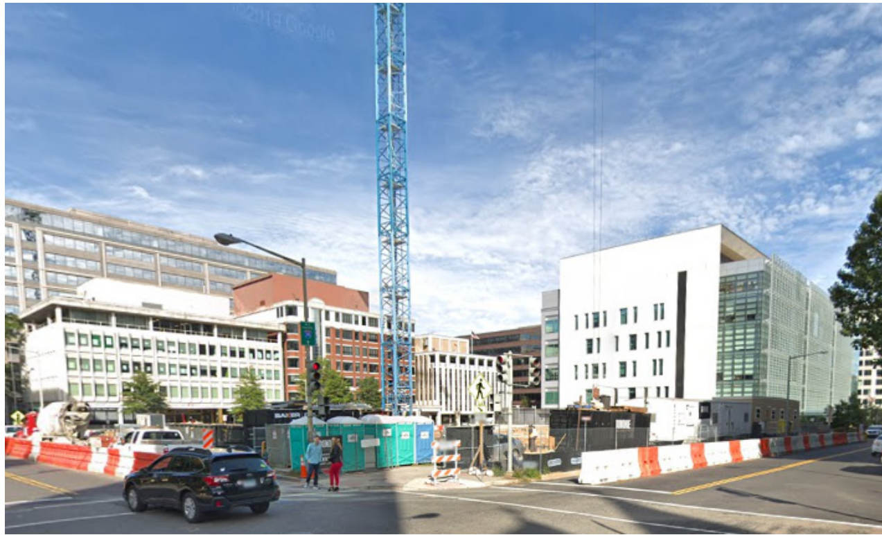
1. 6th Street SW and E Street SW