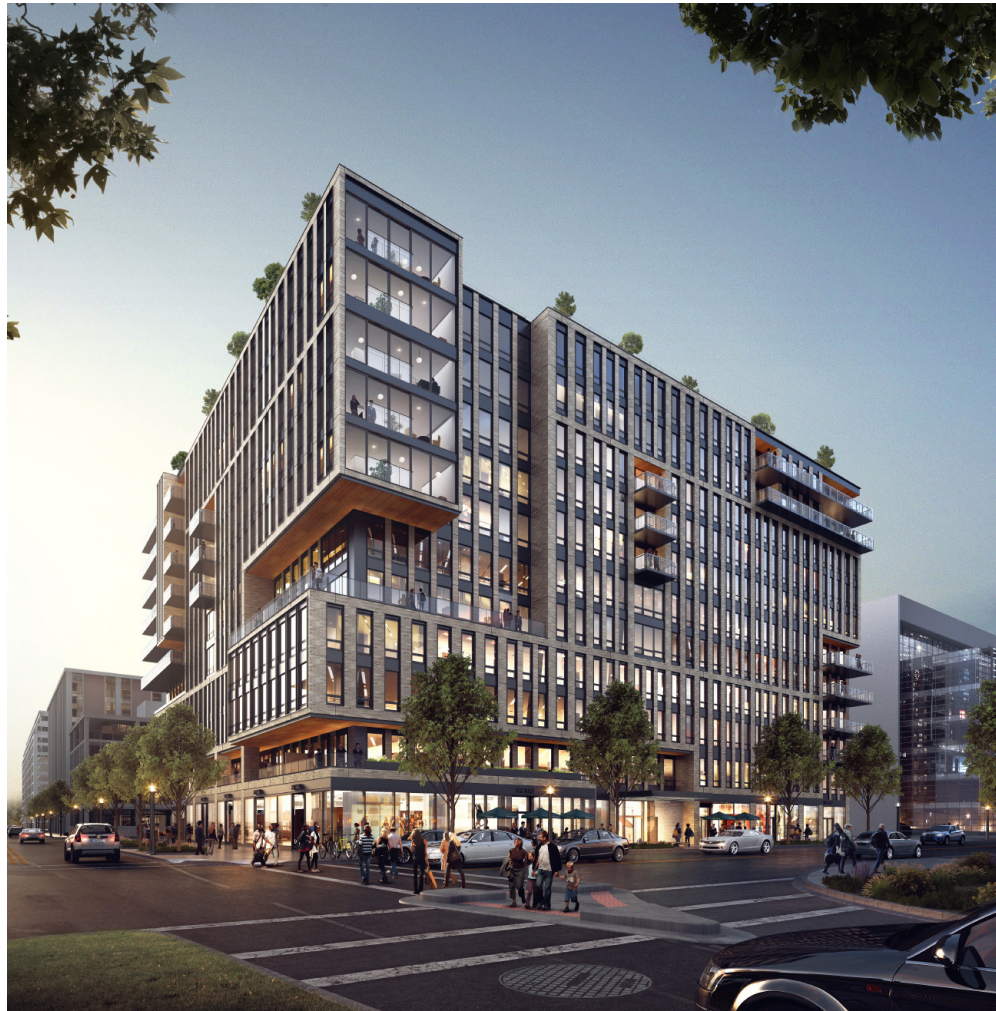
1. 6th Street SW and E Street SW