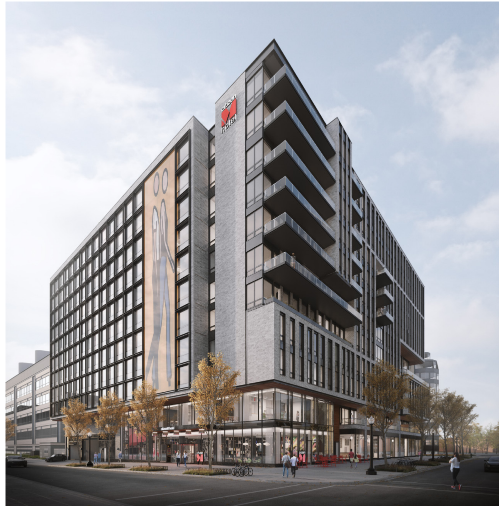
2. 6th Street SW and School Street SW