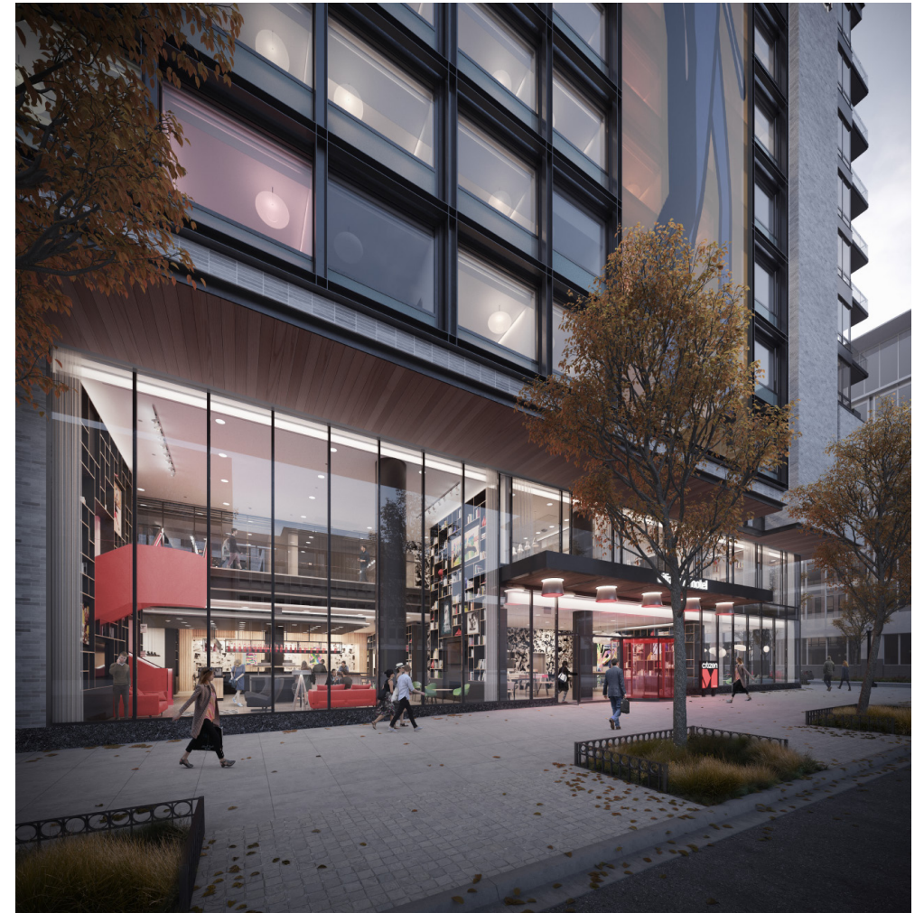
3. School Street SW