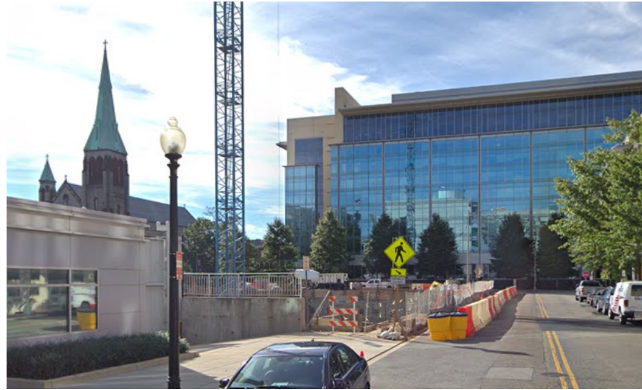
3. School Street SW