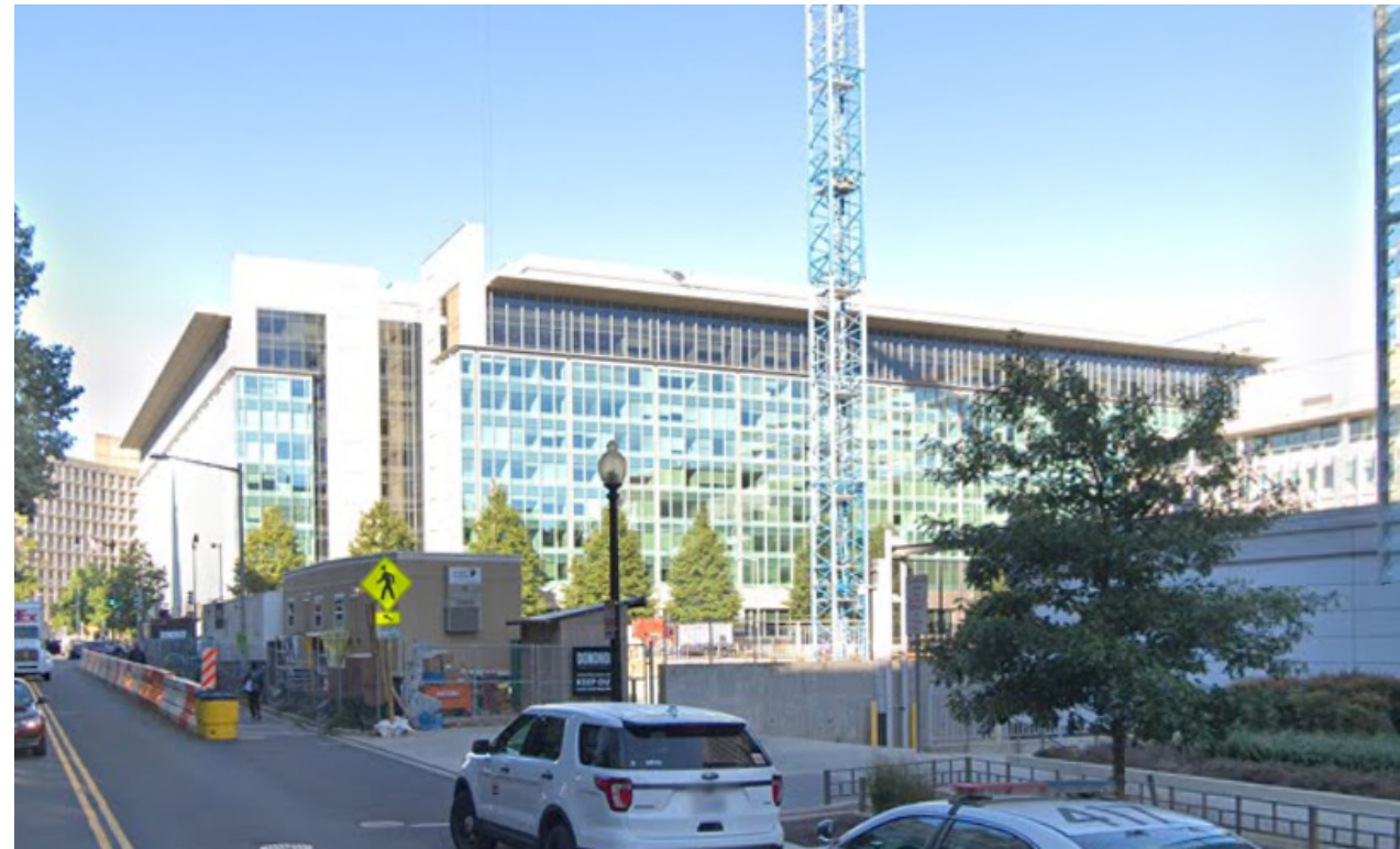
4. E Street SW